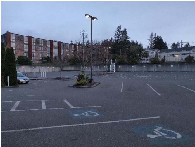
7:00 AM, the Pavilion Lot is empty